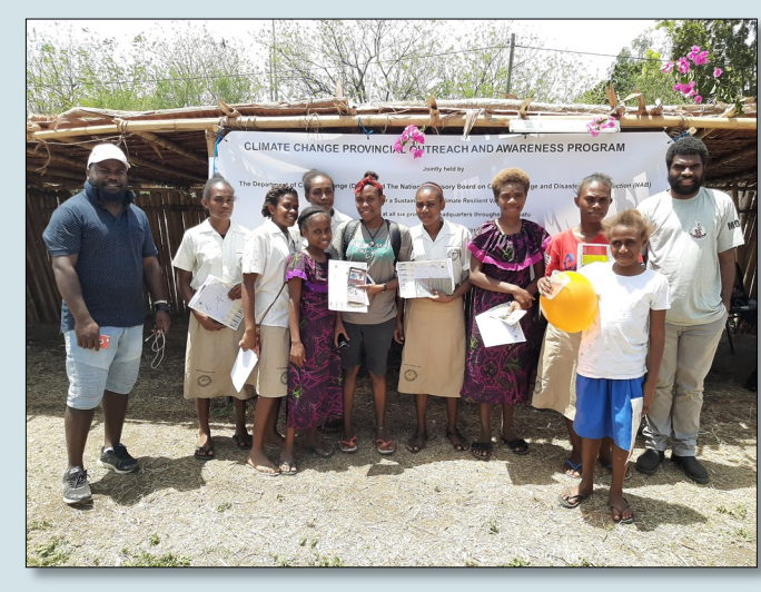
Climate Change community awareness in Malekula.