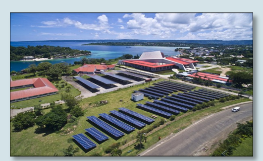
Solar Solutions for the Government; Parliament building complex, Port Vila Vanuatu; Source: https:// www.sunergisegroup.com/parliament-house-vanuatu